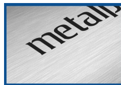
# 4 brushed to resemble a stainless steel finish