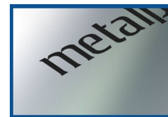
GLOSS highly reflective, mirror-like