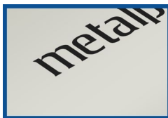
MATTE non-reflective with dull finish