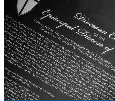
Wayfinding Signage & Blueprint Reproductions