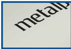
MATTE non-reflective with dull finish