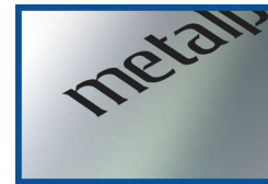
GLOSS highly reflective, mirror-like