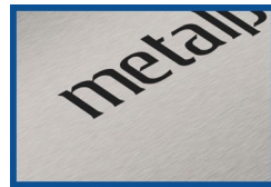
SATIN semi-gloss medium reflective material