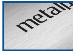
# 4 brushed to resemble a stainless steel finish